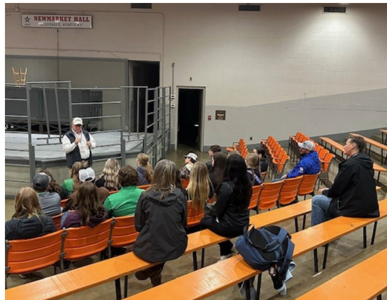
ACDC students were able to get a behind the scenes look at the North American Livestock Show with Deputy Commissioner of Agriculture- Warren Beeler