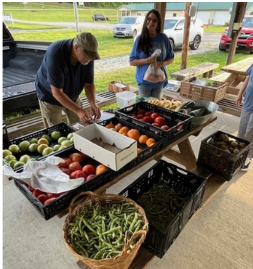
Ruin Creek Farms helping with a SFMNP voucher transaction