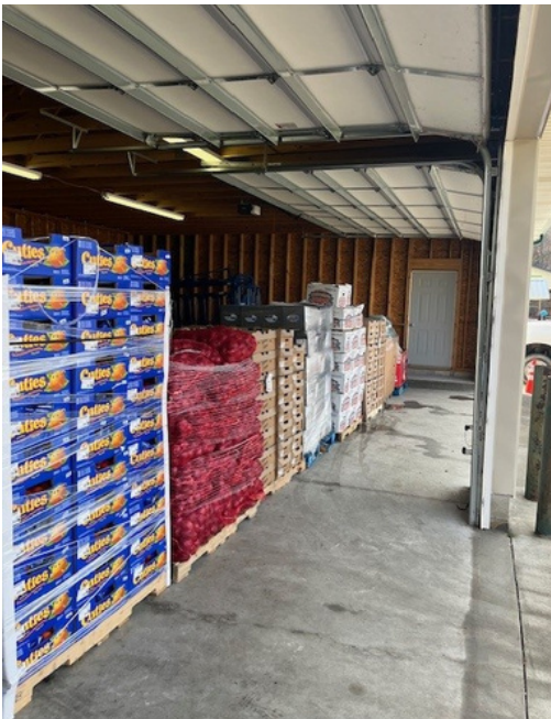
Pallets of fresh produce from Gods Food Pantry.

During the Summer of 2024 the Elliott County Extension Office partnered up with the Rowan County Extension Office to host a food preservation workshop. 19 individuals were able to learn safe home food preservation practices.