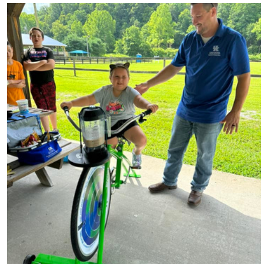
Taking a spin on the smoothie bike to make a healthy treat at the Kids Bucks Kick off

Number of families/caregivers who reported supplementing their diets with healthy foods that they grew or preserved (community or backyard gardens, fishing, hunting, farmers markets)