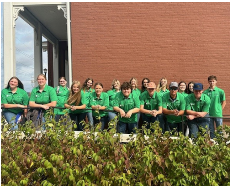
ACDC Students Touring College Of Agriculture at the University of Kentucky

Field trips include a visit to UK college of Agriculture, a behind the scenes tour of the North American Livestock Show, a visit to the West Liberty Veterinarian Clinic, and a Capstone trip to the University Of Auburn!