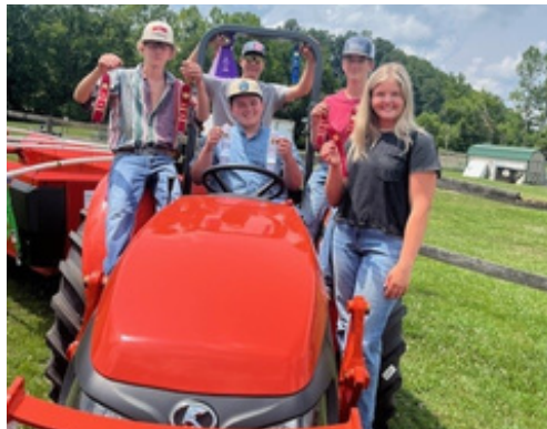
Elliott County 4-H Youth participated in the 2024 Area Tractor Driving Competition