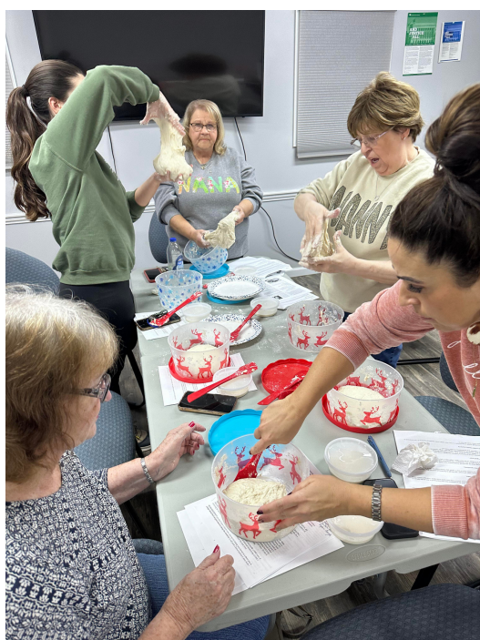
Sourdough class participants