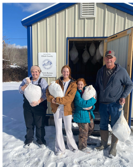
4-H Country Ham participants

Number of youth engaged in FCS 4-H programming