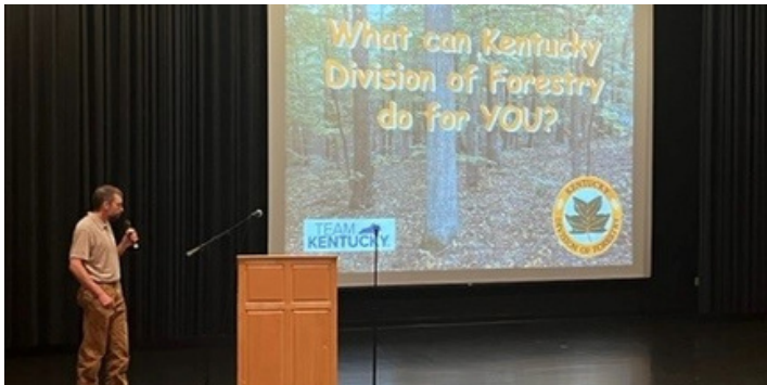
(Presenter from the KY Division of Forestry)