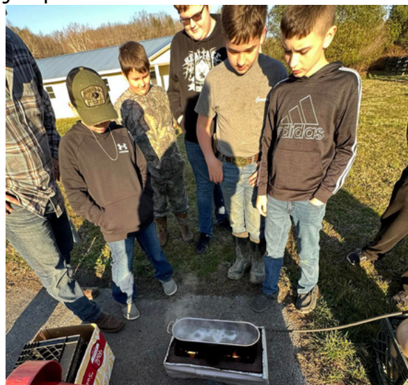
Boiling down maple tree sap to make maple syrup

Number of youth who demonstrated a skill that was learned or improved by participating in 4-H natural resource programming