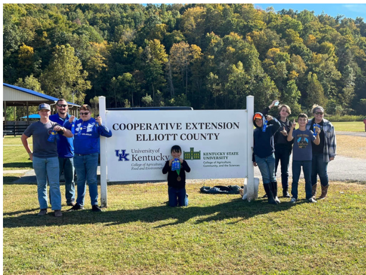
Youth posing with their blue ribbons from the Win With Wood event

With increasing interest in more 4-H forestry/natural resources programming, we have started a 4-H conservation club to continue doing more forestry competitions and for the kids to learn more conservation concepts. In January and February of this year, the youth in our 4-H Conservation club have learned about maple syrup production in Kentucky. We even were able to have a local maple syrup producer from our county come and talk to the kids and demonstrate how to tap a tree and boil down sap to syrup!