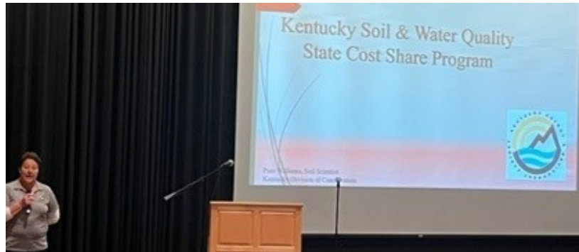
(Presenter from the KY Cabinet of Energy and Environment)

In December, the Elliott County Extension Office hosted a Farm and Forest Informational event at the Elliott County Performing Arts Center. Guest speakers from NRCS, KY Division of Forestry, Kentucky Energy and Environmental Cabinet, and the Farm Service Agency shared about programs they have available to land owners in the county.