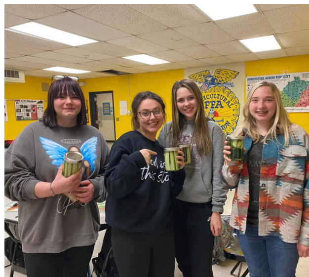
High school students learning how to make refrigerator pickles

Number of individuals who demonstrated safe handling and preparation and/or preservation of food